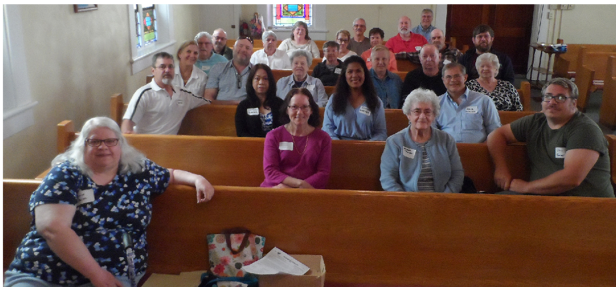
2022 Reunion (June 18 th )